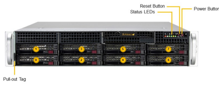
(Front View – System)