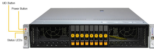
(Front View – System)