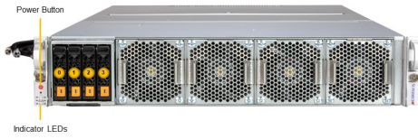
(Front View – System)