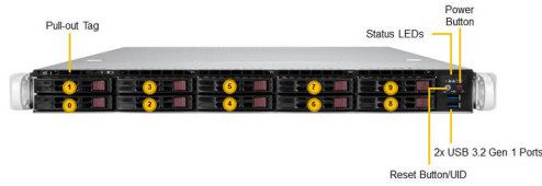
(Front View – System)